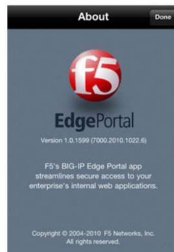
Figure 1: BIG-IP Edge Portal on Apple iPhone

Policy and access management are created and controlled by F5's unique Visual Policy Editor (VPE). Using the advanced VPE, administrators can easily create secure, granular access control policies on an individual or group basis. The flowchart-like GUI gives administrators point-and-click control to seamlessly add iPhone and iPad devices to an existing system or to create a new macro policy exclusively for iOS devices.