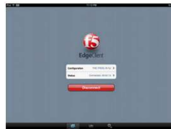
Figure 3: BIG-IP Edge Client on Apple iPad