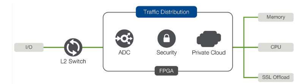
Figure 2: How the BIG-IP iSeries system architecture uses FPGA technology

A balanced approach exploits the advantages of both ASICs and FPGAs.