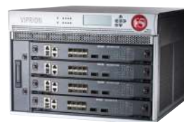
VIPRION 4480 Chassis