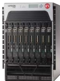
VIPRION 4800 Chassis

BIG-IP PEM is available on the VIPRION C2400, C4800, and C4480 chassis with the B4300 and B4340, both 96 GB blades, and the high-performance 100 GB B4480 blade. BIG-IP PEM is also available as a stand-alone appliance with the new BIG-IP iSeries i5x00, i7x00 and i10x00 appliances, as well as virtual network functions (vPCEF/vTDF) running on BIG-IP virtual editions, which offer the flexibility of a virtual BIG-IP system.